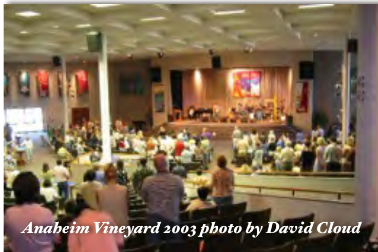
Anaheim Vineyard 2003