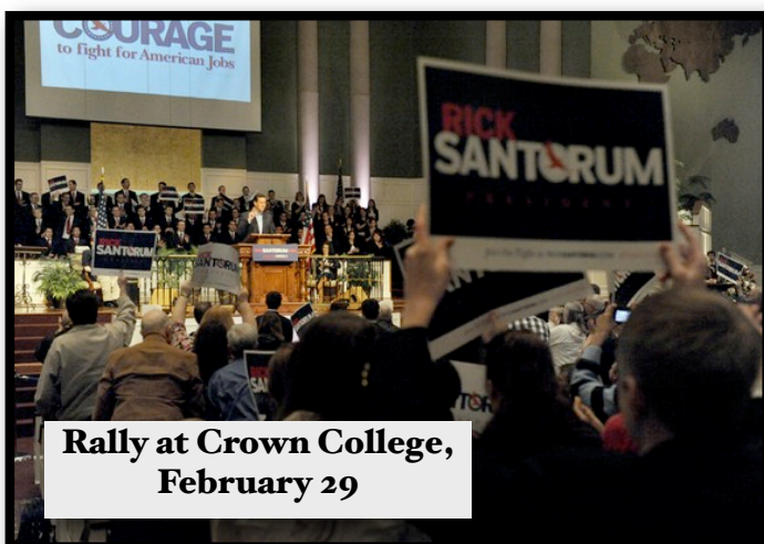
Rally at Crown College, February 29