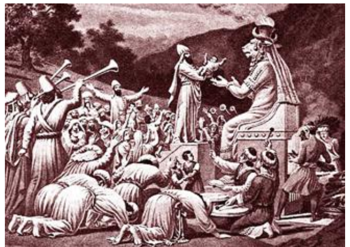
Canaanite child sacrifice

whosoever believeth in him should not perish, but have everlasting life” (John 3:16). Those who charge God with injustice and cruelty ignore the fact that God Himself paid the price demanded of His own holy law so that men can be saved. The heart of God was revealed in the amazing words that Jesus spoke from the cross in regard to the people who had so terribly, unjustly abused him: “Father, forgive them, for they know not what they do.” The God revealed in the Bible is the most compassionate Person in the universe. In fact, He is the source of all true love and compassion, but He is also a thrice holy, lawgiving God, and He cannot be judged by man’s puny, inconsistent standards.