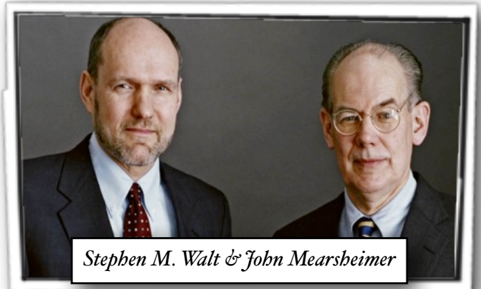
Stephen M. Walt & John Mearsheimer