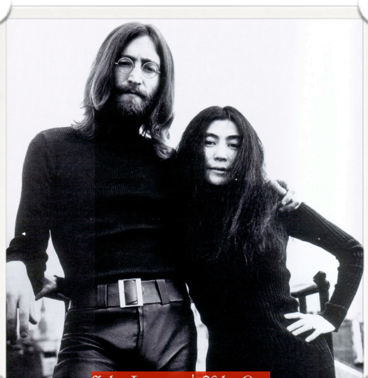
John Lennon & Yoko Ono