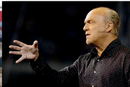
Greg Laurie, founder of the Harvest evangelistic crusades

my sensual rebel rock music (Eph. 5:11) and cut my “freak flag” long hair (1 Cor. 11:14). The Jesus People hippies determined to hold onto both the unholy rock of the world and the holy Rock Christ, but this merger is spiritual adultery, and the fruit has been to usher in the one-world church through addictive, body-jerking, emotion-wrenching ecumenical charismatic music. (See The Directory of Contemporary Worship Musicians for more on Calvary Chapel. It is available for free in eBook format from the Way of Life web site.)