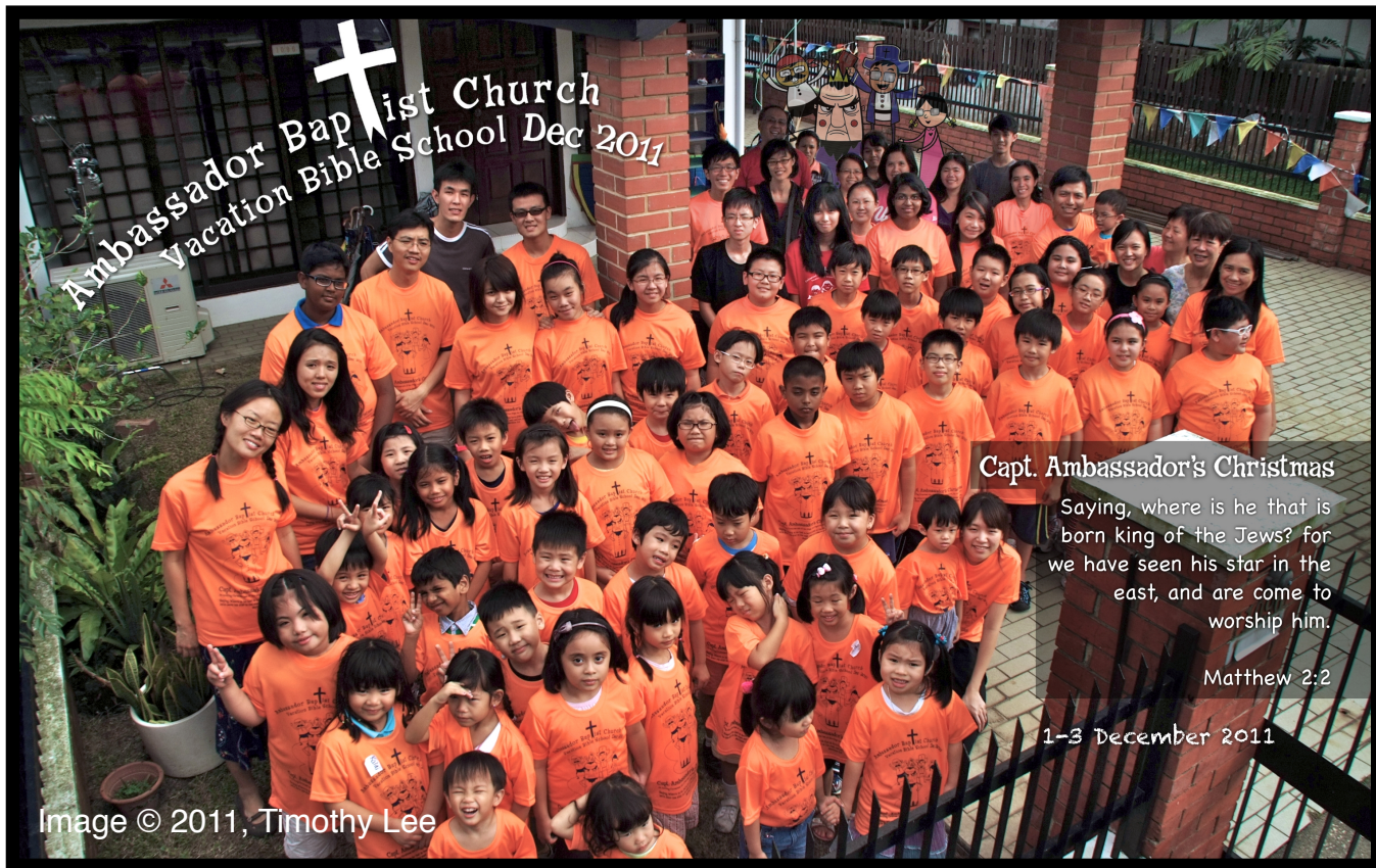
Capt. Ambassador's Christmas

Saying, where is he that is born king of the Jews? for we have seen his star in the east, and are come to worship him.